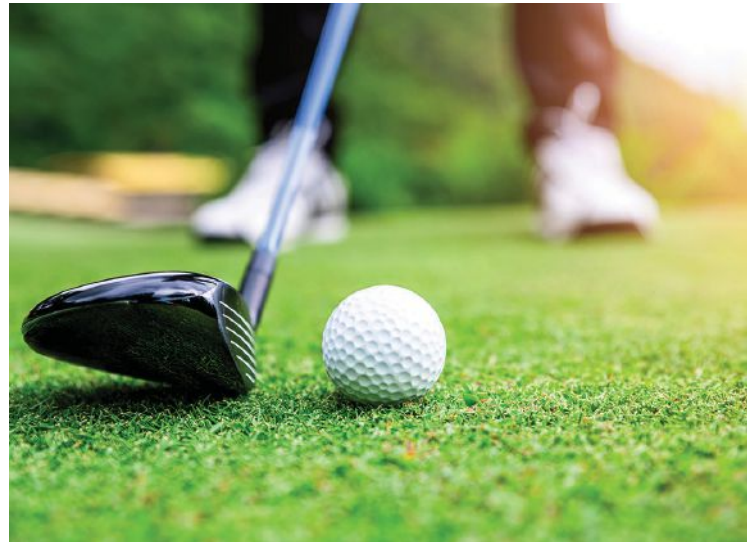
DISTRICT GOLF OUTING hosted by Fond du Lac Evening Lions Club FRI, AUG 9 Tee-off 10:30 am Rolling Meadows Golf Course, Fond du Lac - 560 W. Rolling Meadows Dr, Fond du Lac (across from the Holiday Inn)

Open to all Lions, Lioness, Leos and their guests. Cost $50/golfer includes: 18 holes, 1/2 cart, lunch and prizes. The format will be a 4-person scramble. Bring your friends. This just might be the catalyst to get your golfing friends to join!