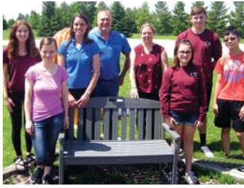
LEO CLUB GETS NEW BENCH PRODUCED

The Husky Hands & Heart Leo Club showed off the recently received bench they earned from Trex Industries for collecting more than 500 pounds of plastic in six months prior to May 2019. The bench has been placed in the Lions Playland area of Kiwanis Park.