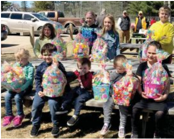
WILD ROSE ANNUAL EASTER EGG HUNT - Around 150 kids participated. ABOVE: Winners of the nine Lions Easter Basket prizes.