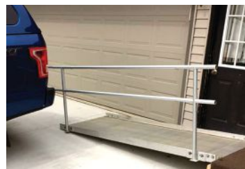
NEW HOLSTEIN INSTALLS 2 MORE RAMPS