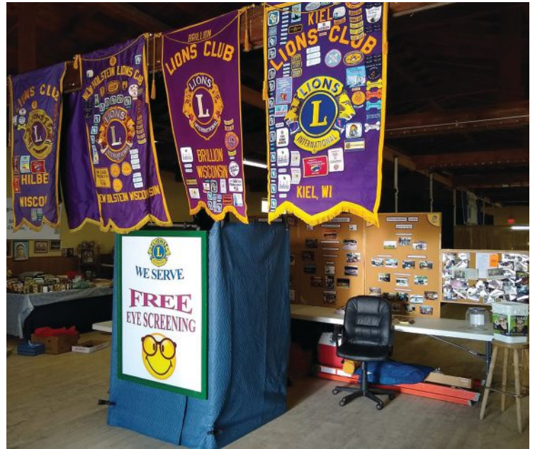
FOUR CLUBS TEAM UP AT THE CALUMET COUNTY FAIR OVER LABOR DAY

HOW DO YOU THANK YOUR SPONSORS & SUPPORTERS? Check out the banner that the Montello Lions displayed at a recent meat raffle thanking their sponsors. Kudos to the Club for soliciting so many sponsors and recognizing them in such a visible way.