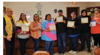
REDGRANITE LIONS WELCOME 6 NEW MEMBERS!