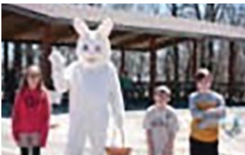
BRILLION LIONS ANNUAL EASTER EGG HUNT DRAWS AREA KIDS - The event started at 12:30 P. M. at a local park. There were two age groups; one for kids five and under and one for kids six to eight years old. The Lions gave 13 big bags of candy for prize eggs for each age group. They also sponsored an open swim for all at the pool in the Brillion Community Center after the Hunt.