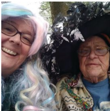
SHEBOYGAN EVENING TRICK OR TREAT AT BOOKWORM GARDENS