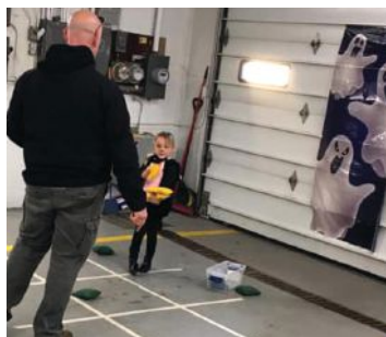
POY SIPPI LIONS THANK EVERYONE THAT CAME TO THE HALLOWEEN PARTY. The Lions love seeing all the kids in their costumes and being there for the community.