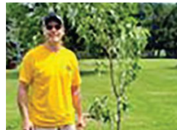
PICKETT SERVES - TOP: Pickett