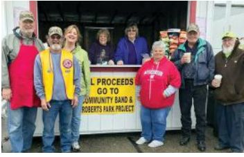
WILD ROSE LIONS ANNUAL BRAT FRY RAISES $1,000 - Half will go to the community band and half will go to the Roberts Park Project.