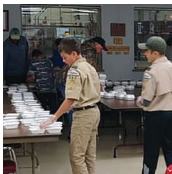
RANDOM LAKE LIONS CHICKEN DINNER A BIG SUCCESS!