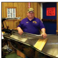
NEARLY 150 ATTENDEES AT THE WILD ROSE ANNUAL SPORTSMAN'S DINNER

Vision and issues related to eyes and eye diseases are among the core missions of Lions Clubs International. To learn more about LCI and their many activities in the community, across Wisconsin and around the world, go to www.wlfinfo.