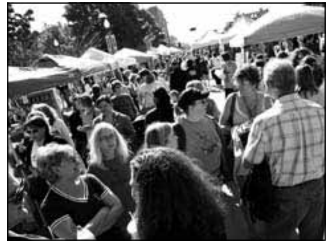
TWO RIVERS LIONS 33RD ANNUAL APPLE FEST SAT, OCT 12 from 8 am to 4 pm

OCTOBER SAT, OCT 19 - Van Dyne Lioness 5th Annual Rummage, Bake Sale & Light Lunch from 8 am - 1 pm at Van Dyne Lions Park. Area residents will also be having rummage sales on that day to make it an area event. Proceeds