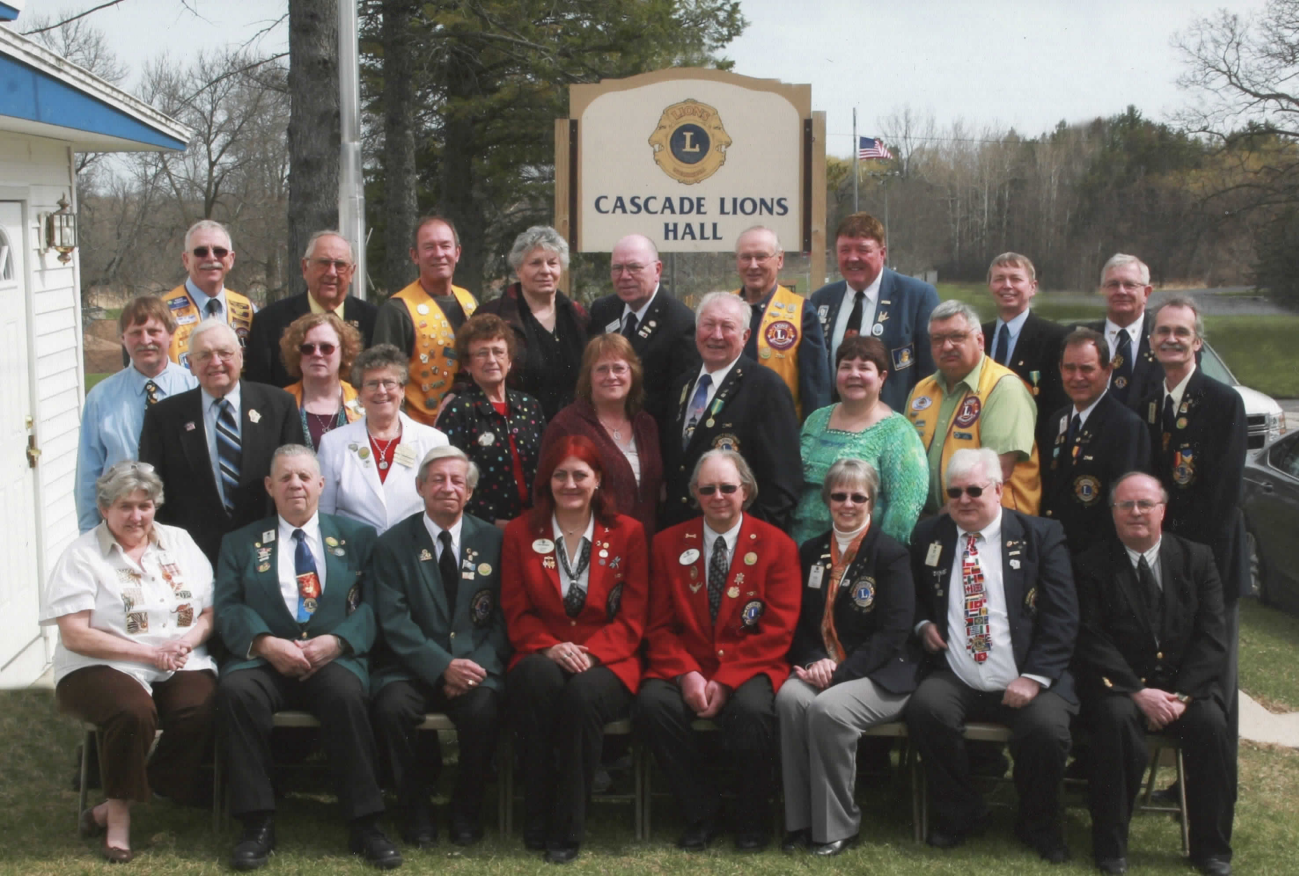
District 27-B1 Cabinet 2013-2014