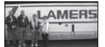
CELEBRATING 20 YEARS OF THE AMSTERDAM LIONS FALL TOUR - Last fall, the Amsterdam Lions took Pine Haven Assisted Living residents of Pine Haven on a tour of the Northern Kettle Moraines. The Club picks up residents at Pine Haven facilities in Oostburg, and two locations in Sheboygan Falls then tours the fall beauty before making a stop at the Dairy Queen in Plymouth, then returning the residents to their campuses. The Fall Tour is popular with the residents with anywhere from 75-100 participating. It requires two coach buses to accommodate everyone. The Lions are busy planning this year's event which will mark the 20th Anniversary of the Fall Tour and will occur the first Monday in October. LOWER LEFT TOP: Residents mug for the camera. LOWER LEFT: The stop at Dairy Queen provides a popular end to a great day. ABOVE: Lions and driver in front of one of the buses.