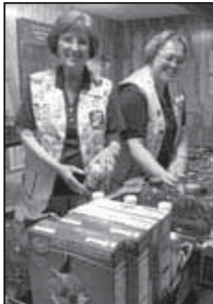
FOOD FOR FREEDOM DRIVE Fond du Lac/Winnebago/Outagamie/Brown/Sheboygan Counties will get the donated food.