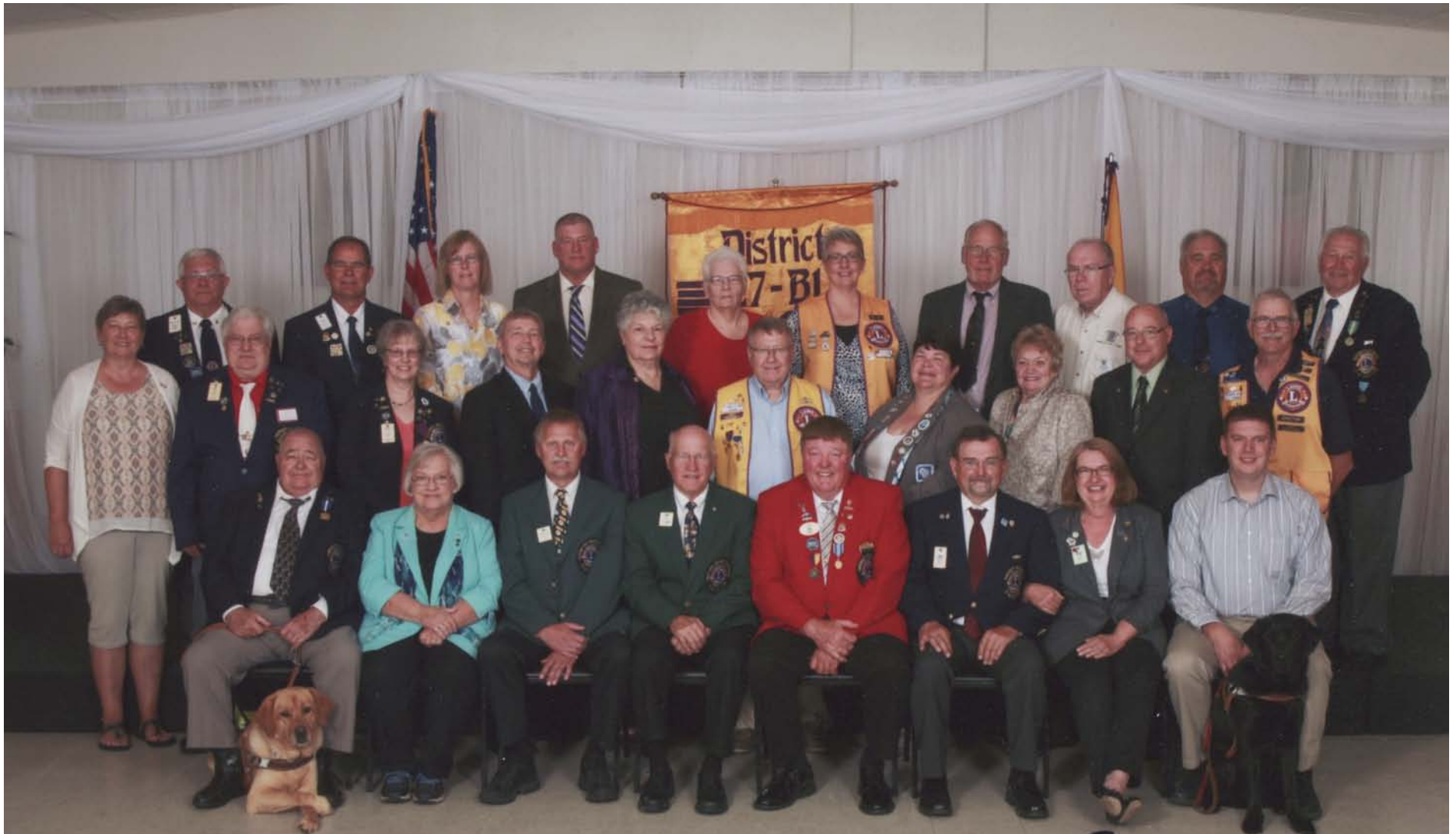
District 27-B1 Cabinet 2017-2018