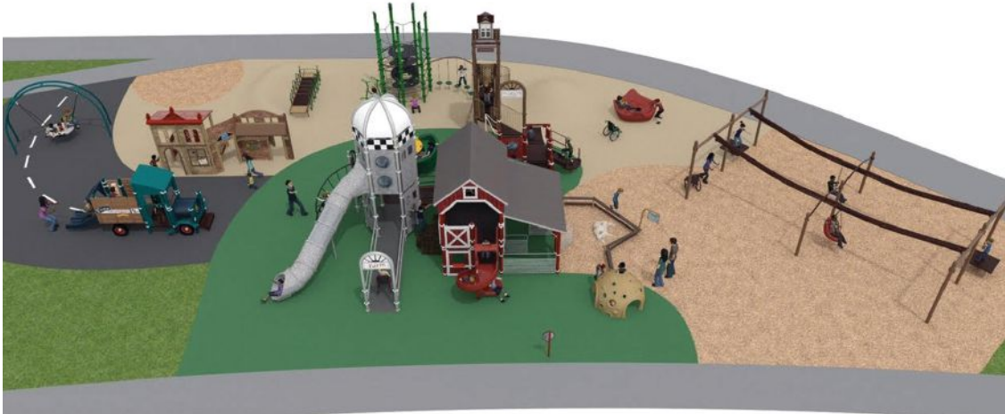
Custom products are shown as conceptual only. *Custom product manufacturing time for this project will be approximately 16 weeks from the time of US order acceptance. ©2016 Landscape Structures. All Rights Reserved.

Plymouth, City Plymouth, WI August 23, 2016 96470-1-22