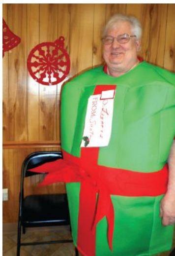
VAN DYNE & FOND DU LAC LIONESS ANNUAL CHRISTMAS PARTY - Forty-

VALDERS BREAKFAST WITH SANTA - The Lions served about 125 adults and children a breakfast of sausage, pancakes, eggs and donut holes followed by a visit with Santa and a gift. Fifteen Lions were there to serve and greet all those that came.