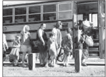
CHILDREN & CHAPERONES BOARDING THE BUS for Mount Olympus trip sponsored by the Neshkoro Lioness.

The Neshkoro Lioness donated the money that was raised from the Lioness 2009 Children's Christmas Fair to the Neshkoro Grade School PTO. The money was used for the entire student body to go on an end of the year trip.