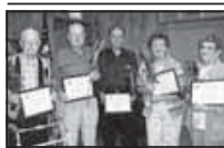
VAN DYNE CLUBS HONORS MEMBERS WITH HONORARY LIFETIME MEMBERSHIPS - by