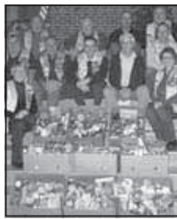
Clubs again teamed up to sponsor the concert.